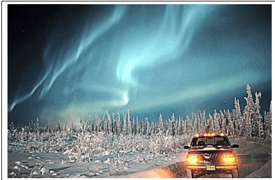
Figure 22 - A photograph of an aurora borealis taken in Alaska. (Courtesy Dick Hutchenson).

Near the poles of Earth, observers have often seen glowing clouds shaped like curtains, tapestries, snakes, or even spectacular radiating beams. Northern Hemisphere observers call them the Northern Lights or Aurora Borealis. Southern Hemisphere observers call them the Southern Lights or Aurora Australis. Because most people, and land masses, are found north of the equator, we have a longer record of observing them in northern regions such as Alaska, Canada, Scandinavia, but sometimes as far south as the Mediterranean Sea or Mexico!